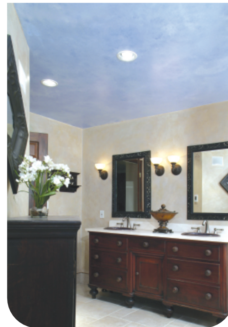
The new master bath is a serene and relaxing retreat. A painted ceiling with fluffy white clouds adds lightness and whimsy to the space while furniture-inspired fixtures and genuine antiques (i.e. the vintage vanity) keep it grounded. Meanwhile, the stoneware tile, warm in both appearance and feel, keeps the bath cozy.